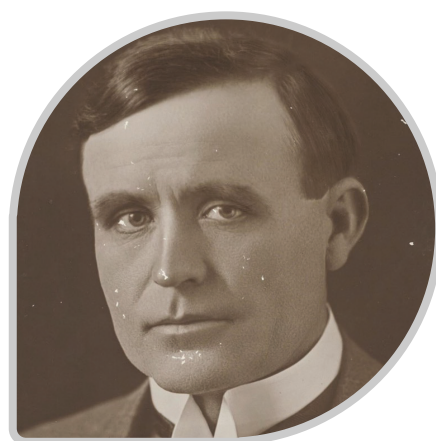
William Alexander Watt - ESU President 1921-25

The ESU proposed that the Australian Electoral Commission (AEC) recognise William Alexander Watt by naming a new Victorian electoral division for the federal House of Representatives in his honour. William Watt was President of the ESU in Victoria from 1921 to 1925. He was Premier of Victoria from 1912 to 1914 and later was the Commonwealth Treasurer, Acting Prime Minister in 1918-19 and then Speaker of the House of Representatives. Unfortunately, on this occasion, the AEC chose to acknowledge other distinguished Victorians. We will continue to seek opportunities to promote recognition of William Watt's service to Victoria and Australia.